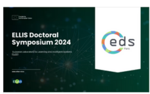
ELLIS Doctoral Symposium #EDS2024: AI & sustainability SAVE THE DATE! The ELLIS Doctoral Symposium (EDS) is coming back this summer and celebrates its fourth edition in Paris, France, Join us from August 26 to 30 for a week filled with science, networking opportunities...

• Save the date for the ELLIS Doctoral Symposium (#EDS2024), focusing on "AI & sustainability," taking place in Paris, France, from August 26 to 30. As the highlight of the year in the ELLIS PhD Program, EDS provides a platform for ELLIS PhD students and others to share insights on machine learning. This year's theme emphasises Al's role in sustainability. Expect poster sessions, keynote speakers, an industry fair, and more. Registrations open in early April at eds2024.github.io. Stay updated on our website and social media channels. Read more..